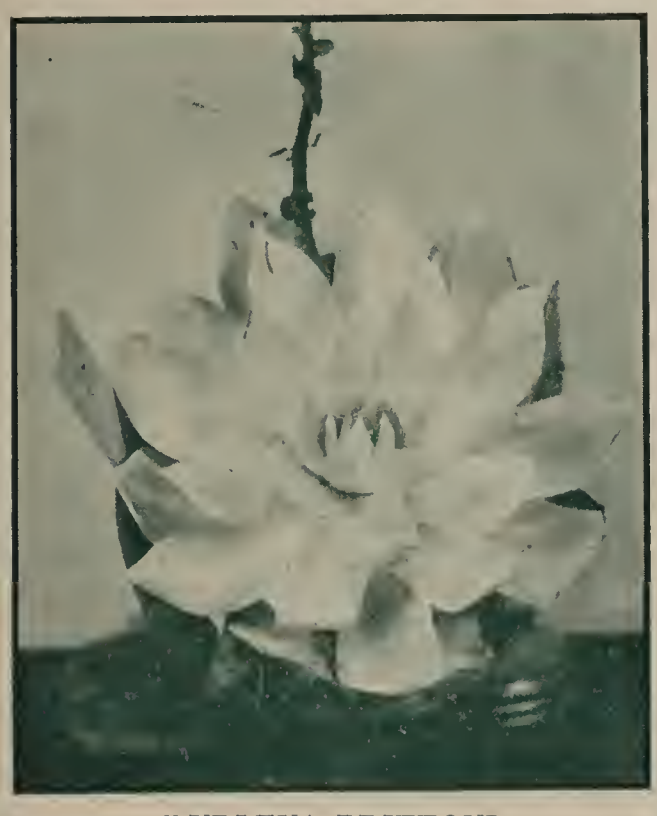
DUDLEYA BRITTONI Typical dudleya shape. Powdery white